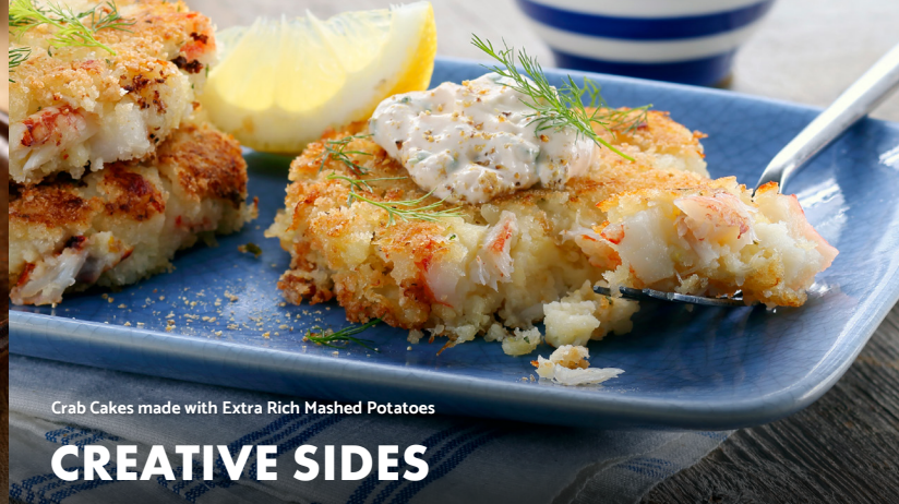
Crab Cakes made with Extra Rich Mashed Potatoes