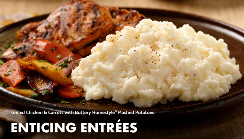
Grilled Chicken & Carrots with Buttery Homestyle® Mashed Potatoes